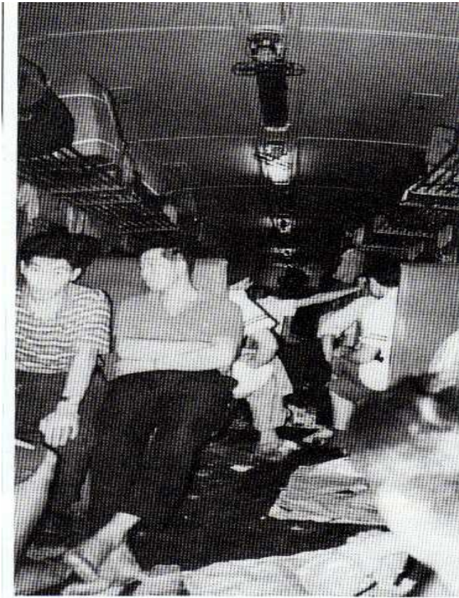
Moving the masses: Interior of "Hard Class" car on train No. 48 to Kunming.

If any member has been on Chinese railways recently it would be interesting to learn whether the authorities have effected cleaner travel than is shown in this picture, taken some years ago.